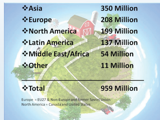
Average Feed Tonnage per Million

Asia continues to be the world's leading feed producing region at 350 million tons. One region, however, exceeded Asia in percent growth over 2011 results. Africa was found to be the fastest growing area in terms of tons of feed manufactured, increasing its tonnage fifteen percent from 47 million in 2011 to 54 million in 2012. The Middle East was estimated to have the largest feed mills, with an average of more than 63,000 tons produced per mill.